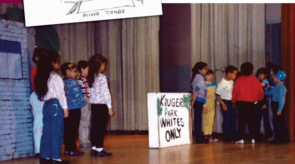
Top: a letter from African National Congress president Oliver Tambo to a young correspondent.